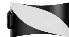
YD21 Silver Ion Massage Belt