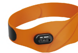
YD08 Massage Belt