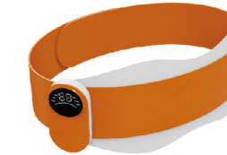
YD12 Smart Massage Belt